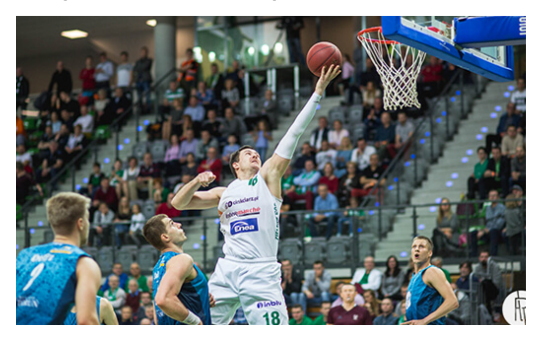
Enea Astoria Bydgoszcz

Title sponsorship of the Polish Champion in men's basketball. In the 2017/2018 season, the team once again won the gold medal in the Polish Basketball League.