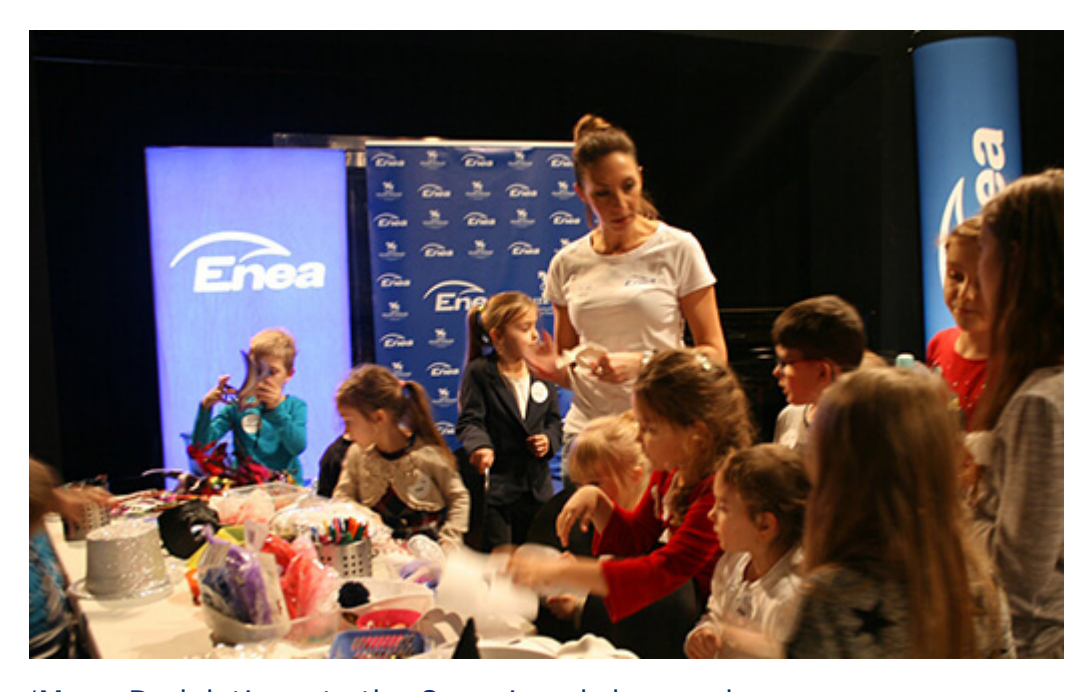
'Mom, Dad, let's go to the Opera' workshop cycle