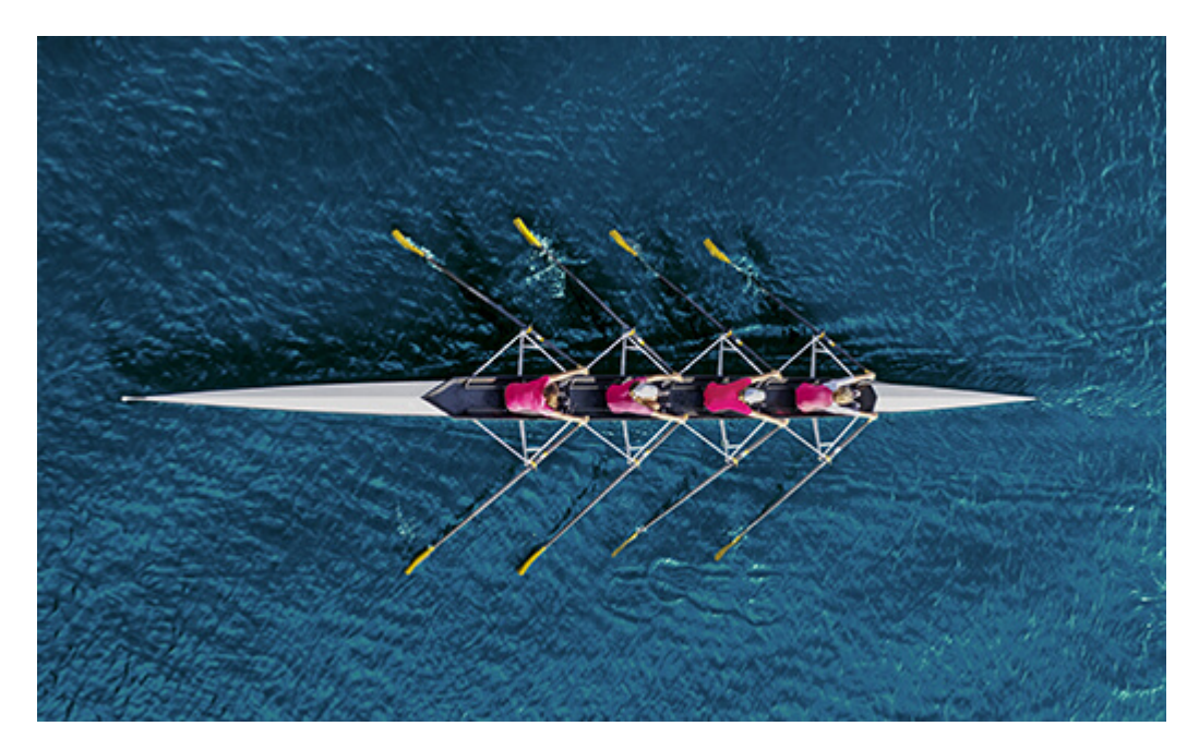
General sponsorship of the Polish Rowing Association

2017 was one of the most successful years in the history of the Polish Rowing Association. In the World Championships in Sarasota, representatives of Poland won three silver medals in Olympic competitions.