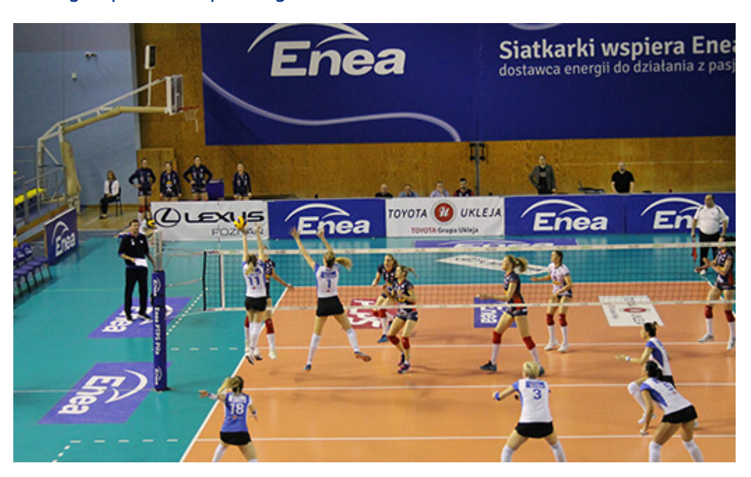
Volleyball players from the Enea PTPS Piła Club

Title sponsorship of women's volleyball in the top class.