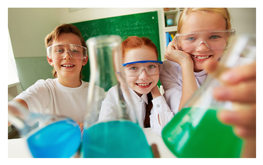
Night of Explorers in Poznań