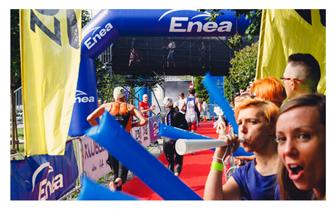
Triathlon (ENEA IRONMAN 70.3 Gdynia, ENEA 5150 Warsaw, ENEA Bydgoszcz Triathlon

We are the most active sponsor of triathlon in Poland – a dynamically developing discipline, which is becoming more popular year by year. In 2017, we were the title sponsor of the largest triathlon competitions in Poland. Both the events under the rank of international federation IRONMAN and the competition in Bydgoszcz gathered a total of nearly 10 000 competitors at the start.