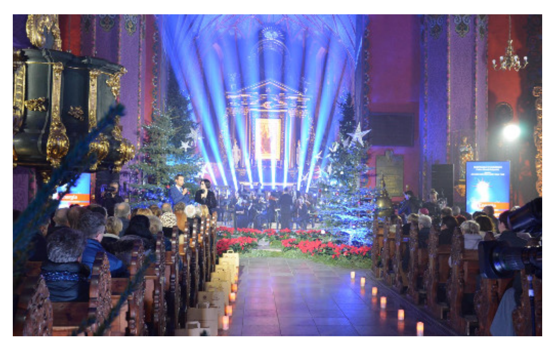
'Energy of Heart'

concerts as part of the nationwide 'Tytka charytatywna' campaign.