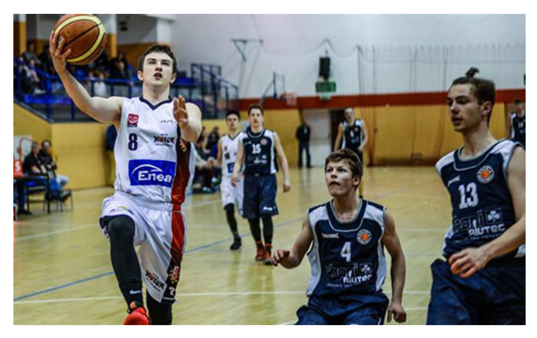
Stelmet Enea BC Zielona Góra Basketball players - Polish Champion 2017

Title sponsorship of the Polish Champion in men's basketball. In the 2017/2018 season, the team once again won the gold medal in the Polish Basketball League.