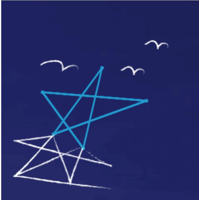
New Central Power Dispatch

Enea Akademia Talentów (Enea Talent Academy) is a scheme offering scholarships to talented primary and middle school students, as well as supporting state primary and middle schools with grants to implement programmes of student talent development. The scheme was offered in the regions where Enea operates. Each student scholarship amounted to 3000 zloty, while the grants came to 10 000 zloty each. The first edition lasted from September 2017 to January 2018. Twenty-two young people, 11 primary school students and 11 middle school students, were granted assistance in three categories: academic achievement, artistic achievement, and sporting achievement. Nine schools were awarded grants to implement interesting educational projects. The scheme will be continued in 2018.