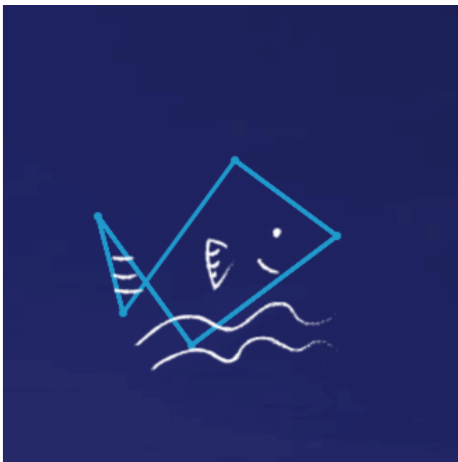
Increasing fish population in the Vistula

In the face of the devastation left behind by the storms on the night of 11/12 August 2017, the Enea Foundation took the decision to help with the recovery efforts of local communities. Many people lost their houses, while public infrastructure was badly affected too. The elements wreaked the worst havoc on the Pomorskie, Kujawski-Pomorskie, and Wielkopolskie provinces. Over 400 km of electric lines needed to be repaired and more than 2500 utility poles set up again. The Foundation donated over a million Polish zloty to causes pointed out by the local authorities, including the renovation and rebuilding of infrastructure and public buildings. Donations were also made to local volunteer fire departments for specialist equipment needed in the aftermath of natural disasters.