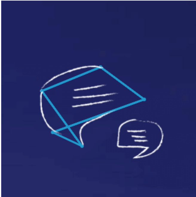
New online chat for Enea's customers

agreement with the Polish Ministry of Family, Labour and Social Policy. ENERGIA+ Rodzina (ENERGY+ Family) is Enea's new package dedicated to families with three children and more. The card comes with a range of discounts on recreational activities and other daily expenses, driving big families' cost of living down. Now, eligible families will be able to buy electricity for less.