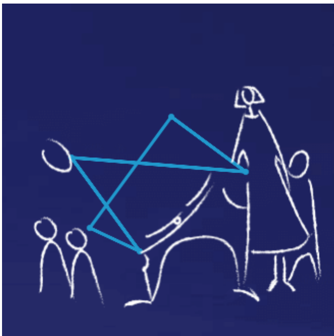
Enea joins the Big Family Card Programme

In 2017 the Enea Group became a member of Polski Autobus Elektryczny – łańcuch dostaw dla elektromobilności (Polish Electric Bus: The Supply Chain for Electromobility). The cluster aims to promote joint actions for the development of e-mobility in Poland, in particular electric buses and their components, based on Polish technologies. The collaboration between energy and automotive companies is meant to facilitate faster R&D and implementation. In particular, this includes developing an electric transit bus design with an improved efficiency achieved with better energy management, upgraded motor and battery, innovative methods of charging, and new standards of engineer training in e-mobility. With Enea as one of its members, the cluster will be able to work out systemic solutions to create the infrastructure for charging electric vehicles. Working to develop electromobility is one of Enea's strategic priorities, as the Group wants to build its potential on innovations in this field.