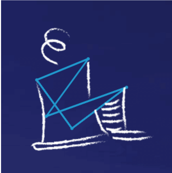
New power block at the Koźienice Power Station

In 2017 the Enea Group launched a new 1075 MW supercritical power block at the Koźienice Power Station, which is the most advanced power unit in Poland and the largest coal-fired unit in Europe. It is also one of the most efficient systems of its kind in the world. As such, it considerably strengthens Poland's energy security. The advanced supercritical technology makes it possible to reduce CO 2 emissions by ca. 25% as compared to other existing black coal-fired power units.