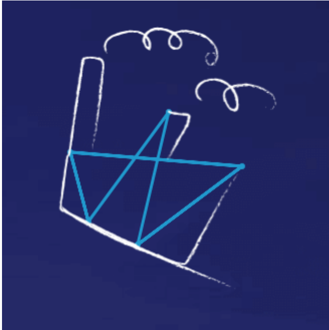
Enea Group acquires the Połaniec Power Station

and develop their business abilities (in technical and operational matters, law and administration, finance and accounting, HR, IT, and trade). The internships last for a year. Seventy percent of the participants of the first edition were offered jobs at Enea. The second edition welcomed another group of 16 interns.