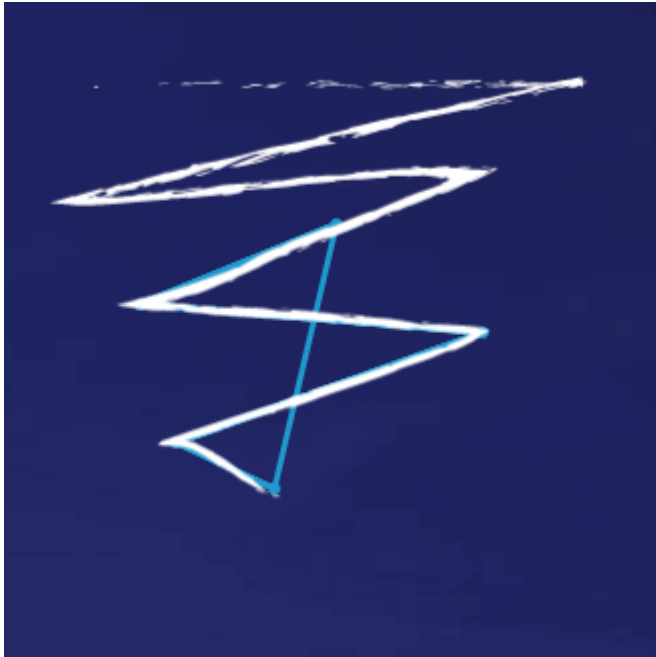
Storms and cyclonic winds

In a constant effort to offer its Customers advanced communication options, in 2017 the Enea Group launched an online chat on its website www.enea.pl . Alongside with the helpline and Online Customer Service, the chat offers a convenient way to contact Enea's consultants with general questions as well as queries about billing and payments, meter readings, or any customer service issues