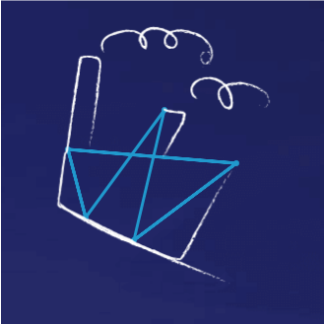
Enea Group acquires the Połaniec Power Station

and develop their business abilities (in technical and operational matters, law and administration, finance and accounting, HR, IT, and trade). The internships last for a year. Seventy percent of the participants of the first edition were offered jobs at Enea. The second edition welcomed another group of 16 interns.