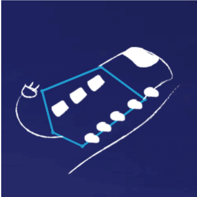
The electromobility cluster

In 2017 the Enea Group became a member of Polski Autobus Elektryczny – łańcuch dostaw dla elektromobilności (Polish Electric Bus: The Supply Chain for Electromobility). The cluster aims to promote joint actions for the development of e-mobility in Poland, in particular electric buses and their components, based on Polish technologies. The collaboration between energy and automotive companies is meant to facilitate faster R&D and implementation. In particular, this includes developing an electric transit bus design with an improved efficiency achieved with better energy management, upgraded motor and battery, innovative methods of charging, and new standards of engineer training in e-mobility. With Enea as one of its members, the cluster will be able to work out systemic solutions to create the infrastructure for charging electric vehicles. Working to develop electromobility is one of Enea's strategic priorities, as the Group wants to build its potential on innovations in this field.