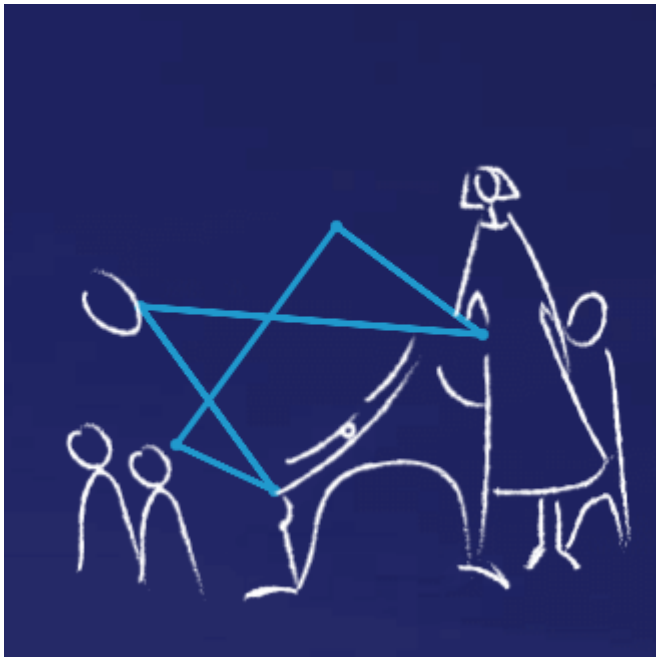
Enea joins the Big Family Card Programme

In 2017 the Enea Group became a member of Polski Autobus Elektryczny – łańcuch dostaw dla elektromobilności (Polish Electric Bus: The Supply Chain for Electromobility). The cluster aims to promote joint actions for the development of e-mobility in Poland, in particular electric buses and their components, based on Polish technologies. The collaboration between energy and automotive companies is meant to facilitate faster R&D and implementation. In particular, this includes developing an electric transit bus design with an improved efficiency achieved with better energy management, upgraded motor and battery, innovative methods of charging, and new standards of engineer training in e-mobility. With Enea as one of its members, the cluster will be able to work out systemic solutions to create the infrastructure for charging electric vehicles. Working to develop electromobility is one of Enea's strategic priorities, as the Group wants to build its potential on innovations in this field.